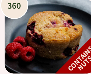
Pear & Raspberry Cake