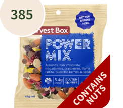
Gourmet Trail Mix