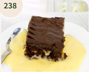
Chocolate Fudge Cake with Custard