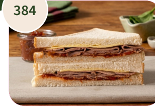
Beef, Cheese & Relish Sandwich