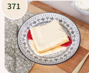
Strawberry Cream Gateau