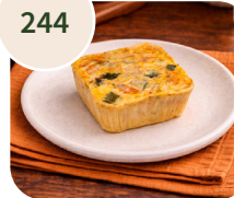
Pumpkin, Potato & Feta Frittata