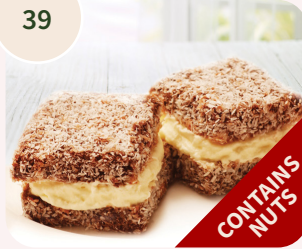
Lamingtons with a Light Cream Filling