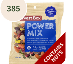
Gourmet Trail Mix