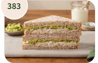
Chicken & Avocado Sandwich