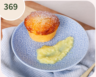
Lemon Drizzle Cake with Custard