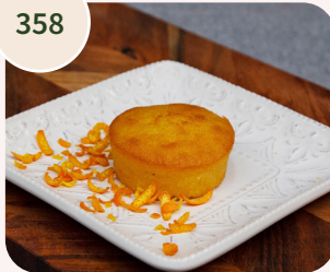
Orange & Almond Cake