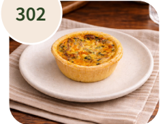
Ham, Tomato & Leek Quiche