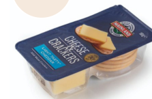
Cheese & Water Crackers