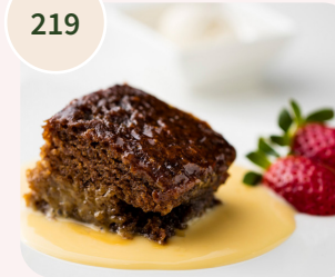
Sticky Date with Custard