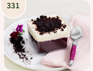
Red Velvet Cheesecake