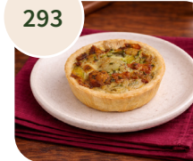
Bacon, Potato & Leek Quiche