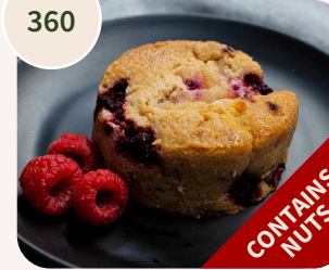
Pear & Raspberry Cake