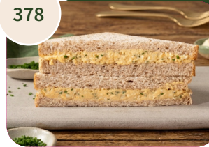
Egg & Chive Sandwich